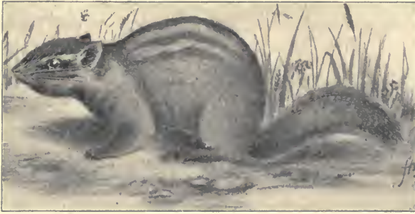
FIG. XXVII. TAMIAS OBSCURUS. LOWER CALIFORNIA CHIPMUNK.